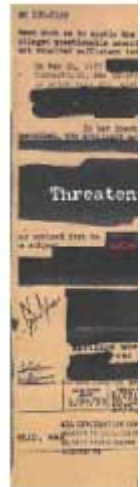
Threatenin McCarthy Surveillance By Da